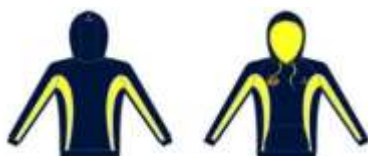
Hoodie OR Track

The following items of PE kit are Optional Items and are to be purchased from Beat School Uniform