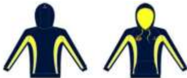
Hoodie OR Track Jacket

The following items of PE kit are Optional Items and are to be purchased from Beat School Uniform